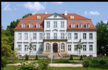
Castle Güldengossa, close to Leipzig, Germany