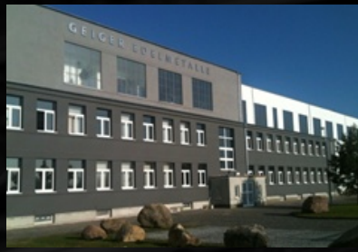
Order processing, logistics and production center Leipzig