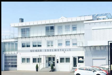
South Germany branch