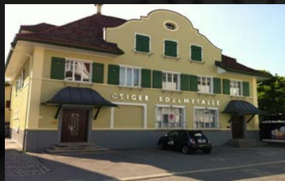
St. Margrethen, Switzerland

Geiger Edelmetalle GmbH Stromstraße 6 04579 Espenhain