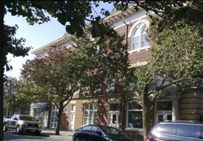
USA branch/ Inwood, New York